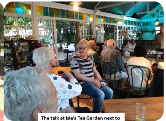
The talk at Isie's Tea Garden next to the Big House