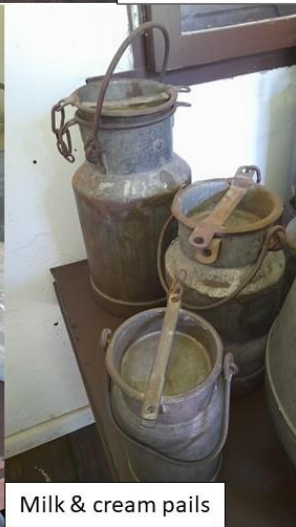
Milk & cream pails

Should you wish to be removed from this mailing list by replying to this email and we will act accordingly. Also, do not hesitate to spread the word of the talks and walks to interested individuals or friends!