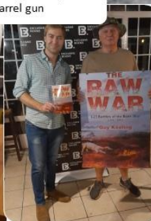
Isie's Tea Garden Exclusive Books & the author