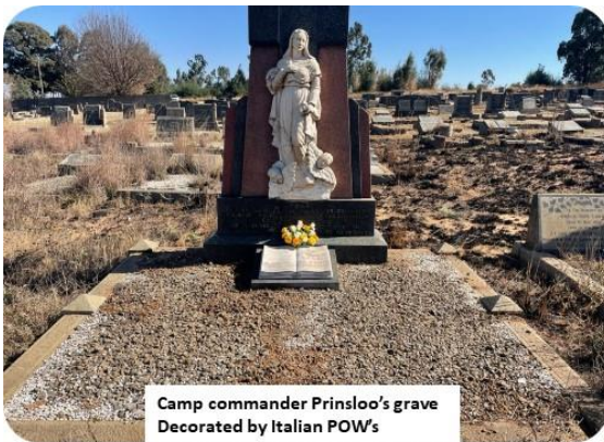
Camp commander Prinsloo's grave Decorated by Italian POW's