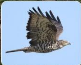
European honey buzzard Wespedief