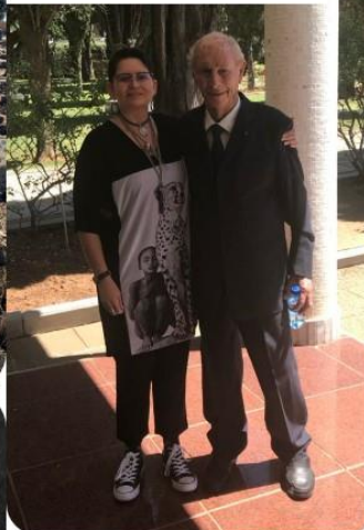
15 Feb. 2024 - Claudia Fratini The artistic memory of the Zonderwater POW

The objects created during WW II by Italians provide evidence of material culture.